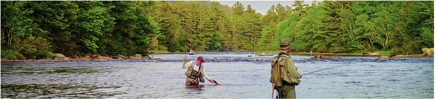
Fishing Scene on the West Branch of the Penobscot