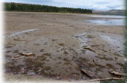
Dewatered littoral – Aziscohos Lake