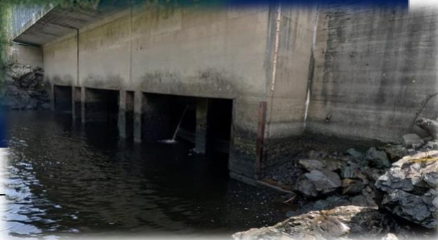
No flow due to generator trip event – McKay Station