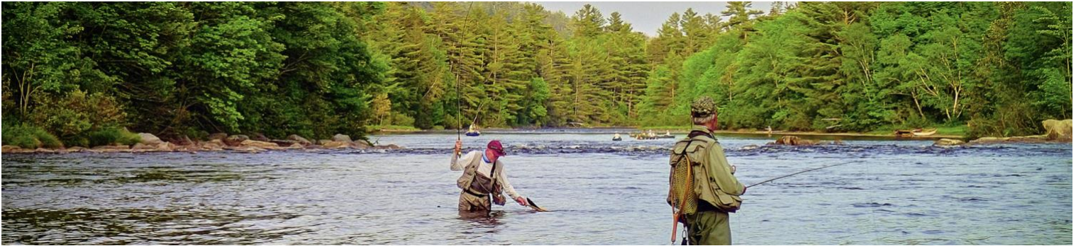
Fishing Scene on the West Branch of the Penobscot