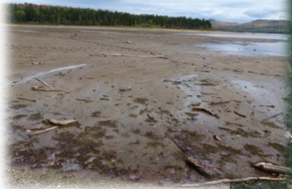
Dewatered littoral – Aziscohos Lake