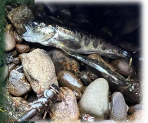
Dead salmon parr and stone fly nymphs – Big A Falls on the West Branch